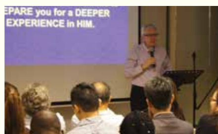
Asylum Ministry 尋求庇護者及難民事工