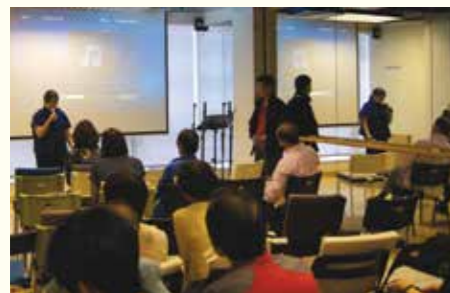
New Wine Ministries Hong Kong Fellowship Gatherings 香港新葡萄基督團契聚會