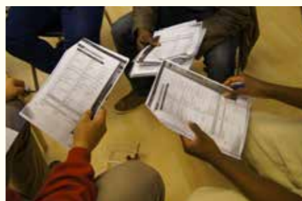
Lecture on Aug 12, 2014 at Cancer Center 講導 2014年8月12日於 癌症中心