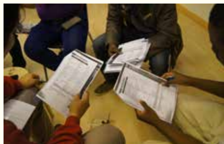
Lecture on Aug 12, 2014 at Cancer Center 講導 2014年8月12日於 癌症中心