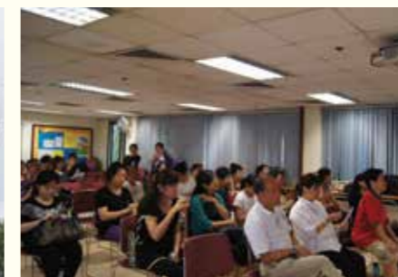
Camp Event on Jun 3, 2014 at Tao Fung Shan 香港新葡萄基督啓發戶外活動 營 2014年6月3日於道風山