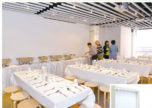
Dining Room 餐廳

多用途空間讓我們因應需要調整為不同面積的禮堂、輔導室、可容納50人的餐廳及廚房。