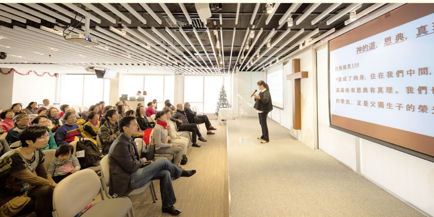
December 16, 2017, Chinese Fellowship Gathering, Wong Chuk Hang 2017年12月16日，黃竹坑聯歡聚會(中文部)

The program consists of the fellowship, worship, talks, testimonies, prayer ministry, lunch, film entertainment and afternoon tea. Medical talk by medical experts proved to be very favourable additional to christian preaching and teachings.