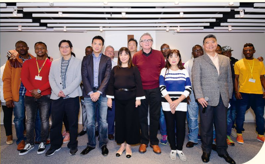
December 11, 2017, Asylum Seekers Christmas Party 2017年12月11日，尋求庇護者聖誕聯歡會