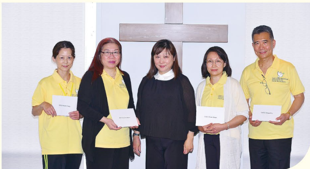
September 22, 2018, Certificate Giving, Deep-Level Healing Training Course completion certificate

In 2011, many people who came to the ministry for healing had given many testimonies. Healings such as cancers, diabetes, glaucoma, insomnia, chest pain, healing of emotions and healing of anxiety took place for different people.