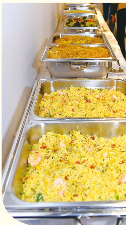
March 10, 2018, Chinese Fellowship Gathering, Wong Chuk Hang 2018年3月10日，黃竹坑聯歡聚會 (中文部)