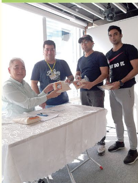
October 8, 2018, Rice Giving, Wong Chuk Hang 2018年10月8日於黃竹坑捐贈派米