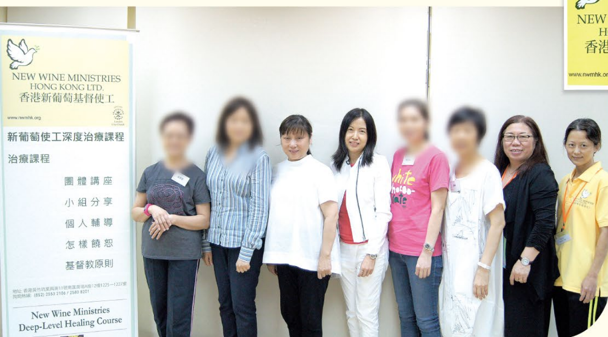
July 31, 2018, Certificate Giving on Course completion 2018年7月31日, 完成課程證書頒授

Deep-Level Healing Course is vital for the recovery and transformation of life. There are 4 lectures and 3 one-on-one individual sessions with some works conducted by Rev Noreen Siu, the course is based on the biblical principles. The program is funded by NWMHK and a free service for other outreach cancer centres.