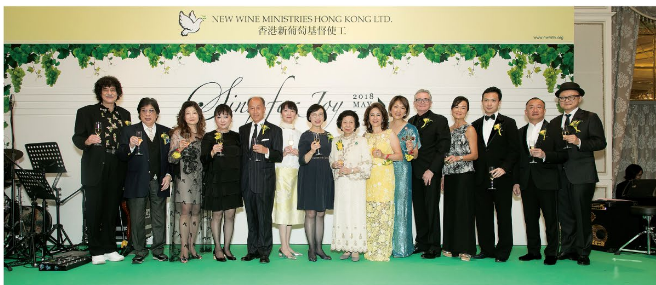
(Left 7) Professor Sophia Chan Siu-chee, JP Secretary for Food and Health and New Wine Ministries Hong Kong Directors, Sub-title Sponsors, Committee Chairmen and Members

With the help from many friends, supporters, sponsors, donors and committee members, we had a successful fundraising evening.